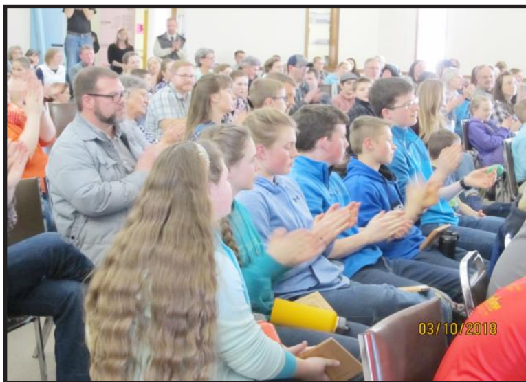
Young people from Christ's Church in Missoula in the foreground part of the crowd assembled for Bible Bowl 2018 Christ's Church Bozeman, MT

“I have come in My Father’s name, and you do not receive Me; if another shall come in his own name, you will receive Him.”