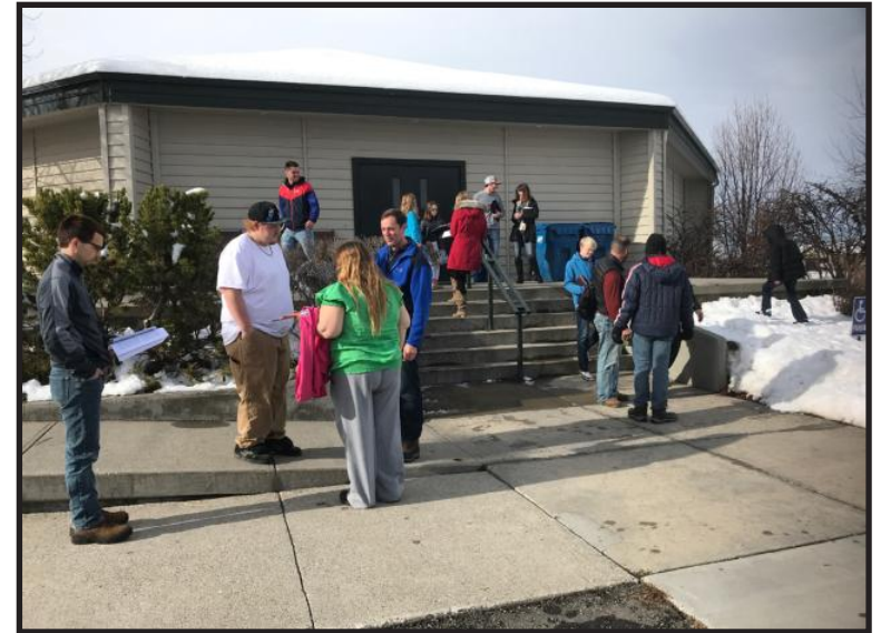
Saints visiting after assembly Christ’s Church Bozeman, MT

She will be led to the King in embroidered work; the virgins, her companions who follow her, will be brought to You