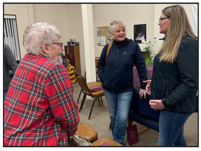
Ladies from Christ's Church in the Flathead enjoying some fellowship following the Grand Canyon presentation Kalispell, MT

"I call heaven and earth to witness against you today, that I have set before you life and death, the blessing and the curse. So choose life in order that you may live, you and your descendants." -- Deuteronomy 30:19